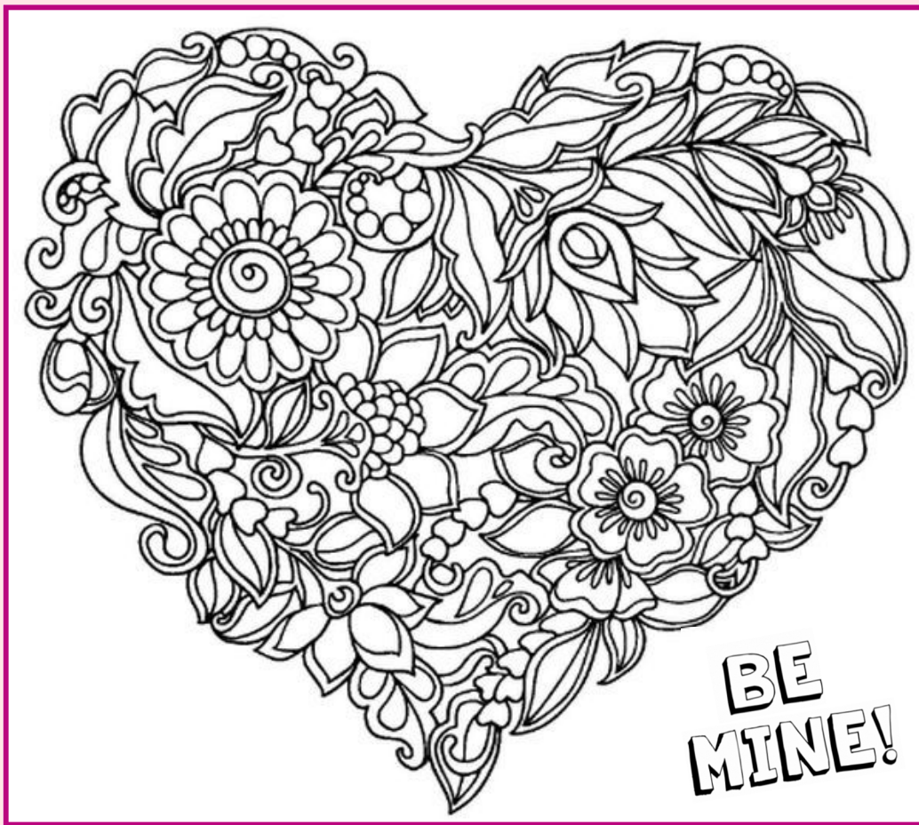
Valentine Colouring Fun